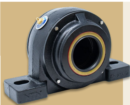
NTN SPAW/SPW Mounted Roller Bearing Units

Water, heat, dust and dirt are the standard operating conditions of the pulp and paper industry. That's why your mill requires bearings that can withstand these uptime killers. Backed by our team of service engineers, NTN provides you the products and know-how you need to get going.