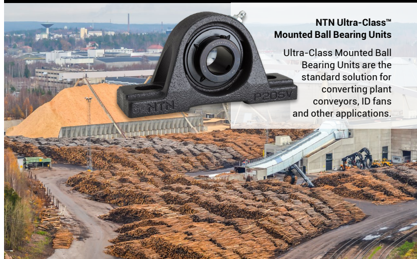
NTN Ultra-Class™ Mounted Ball Bearing Units

To help deliver more uptime and output, NTN's heavy-duty products are built to exceed industry requirements for durability in the most demanding conditions. With reliable products like NTN Ultra-Class™ Mounted Ball Bearing Units and SPAW/SPW Mounted Roller Bearing Units, you're ready to meet your mill's demanding production targets.