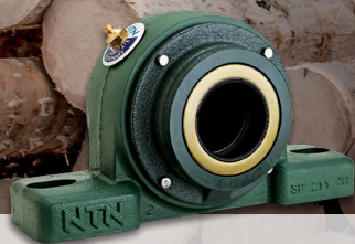
SPAW/SPW Mounted Roller Bearing Units

Start running longer and more reliably with NTN . Our bearings are engineered to tackle the brutal environments of mill work—and we back them with quick availability plus hands-on support, training and trouble-shooting.